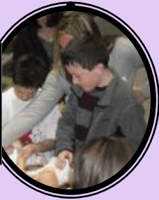
Dress the Baby Relay