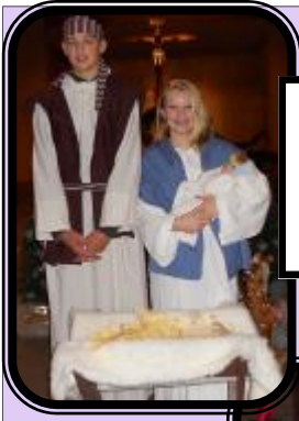
Christmas Prayer Service