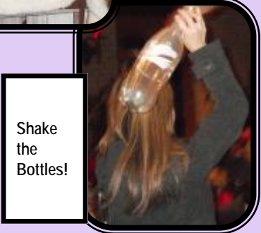
Shake the Bottles!