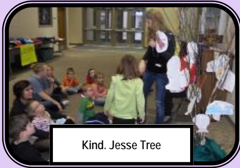
Kind. Jesse Tree