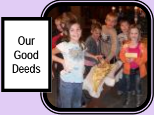
Our Good Deeds