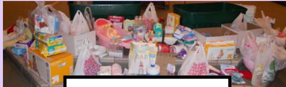
Baby Shower Gifts